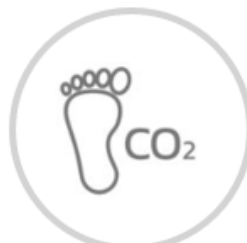
Reduced carbon footprint