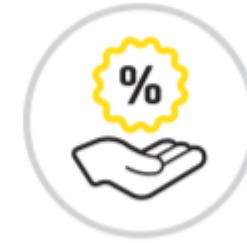
Good value for money