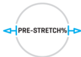
Pre-stretch capability of up to 250%